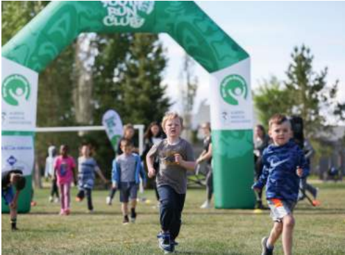
You helped Introduce the Love of Running

(Click on any story below to read more).