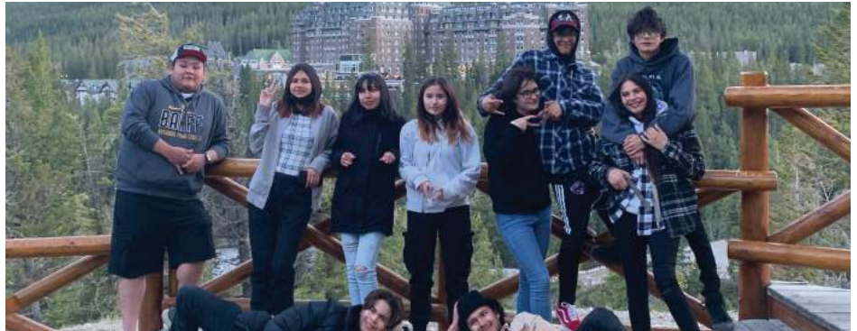
You helped Students Graduate and Supported Youth Workforce Participation