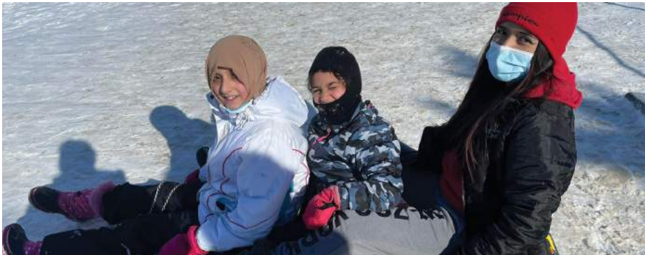
You Helped Make Canada Feel Like Home