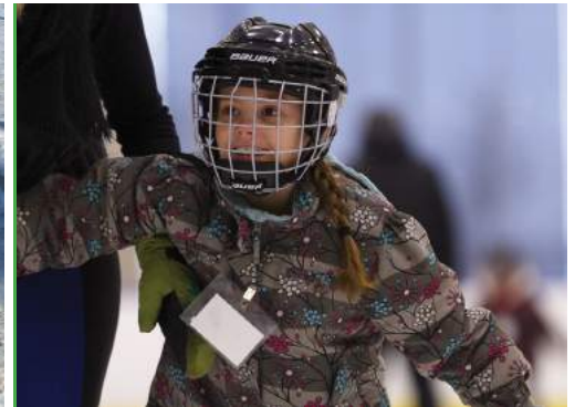
You Helped Children Learn To Skate