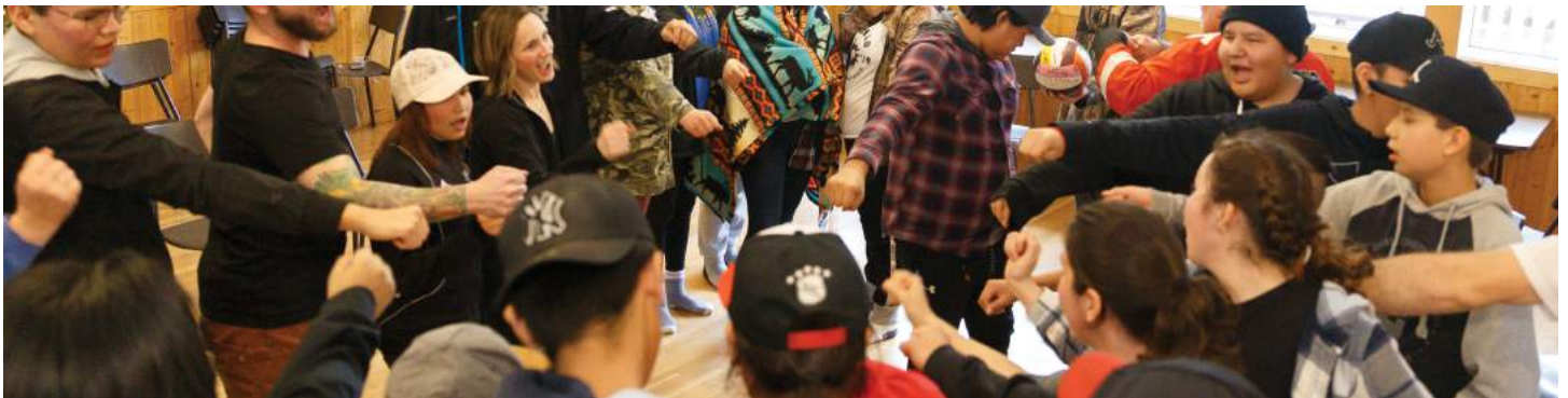
You Helped Strengthen Peer Connections In Indigenous Communities